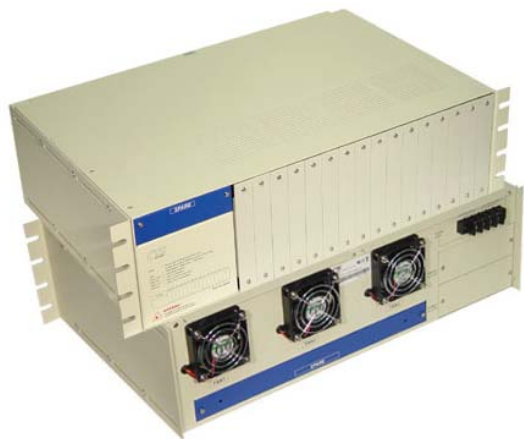
19" 3U RACK MOUNT SHELF 16+SNMP SLOT AC POWER SUPPLY 90V TO 264V AC SNMP CARD W/RS232 AND 10BASE-T